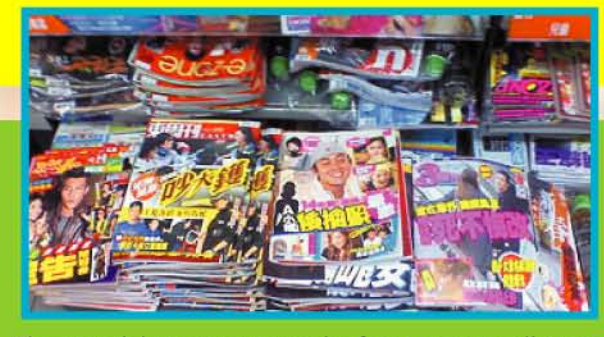
The scandal continues to take front page in all Hong Kong tabloids.

instance, nude photos and videos. The access to these things is too easy.