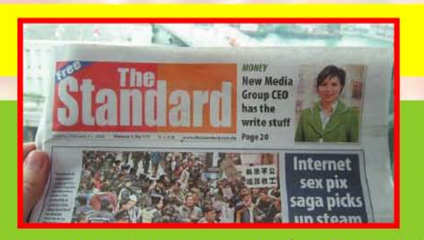
Hong Kong tabloids: Here's a snapshot from The Standard

Firstly, the control and management concerning indecent and obscene items on the Net is not enough. The only thing being done is netizens are asked whether or not they are over 18 years old when logging on. If you are over 18, you can enter. If you aren't, you are supposed to close the browser. However, how many people would honestly answer the question? Ask yourself. Therefore, more should be done to protect the innocent from indecent and obscene articles, for