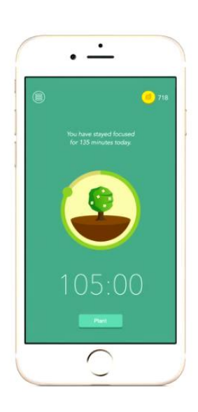
Whenever you want to focus on your work, plant trees

Forest is an app that can help you stay focused while doing your work. Whenever you need to be focused, just click on the start button, then the seed will start to grow into a big tree. However, if you want to use your phone while working on your tasks, your seed will immediately wither. Day by day, every tree you planted will become a big forest! Isn't it interesting?