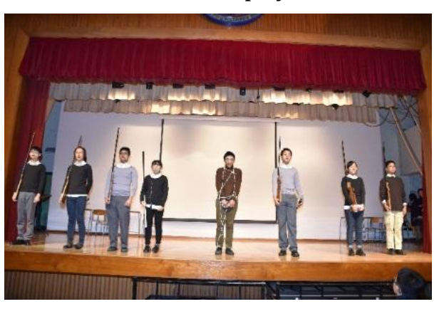
Drama Club Performance